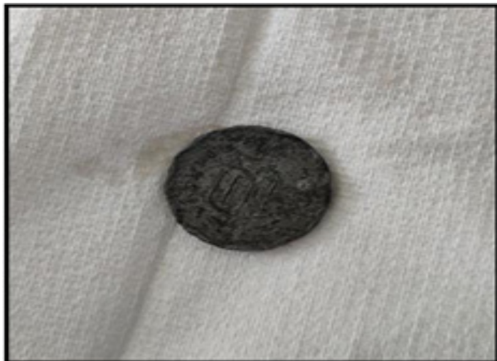
Figure 1: (a) X-ray 1st and 3rd day (b) day 6th (c) day 7th repeated X-ray

Therefore, the protocol was followed continuously while monitoring the movement of the coin by repeating the plain radiological image. At the day of 7 th , the coin reached the distal part of GI tract (Figure:1c) and the coin was eliminated with the stools within two days after applying the non-invasive therapeutics intervention (Figure 2).